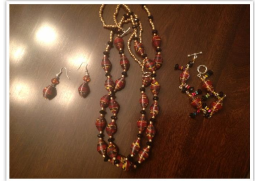
Paper Bead Jeweler