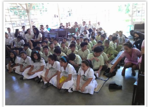
KFCI Program at CBS