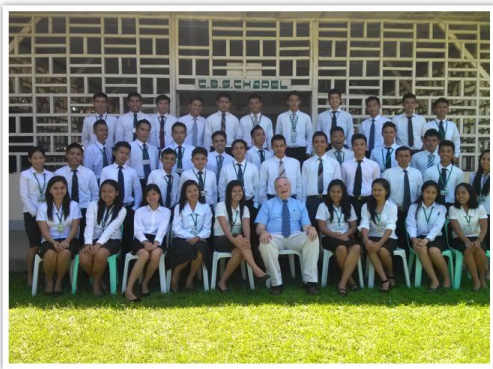
Cebu Bible Seminary