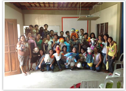
Bacolod Training at VFM