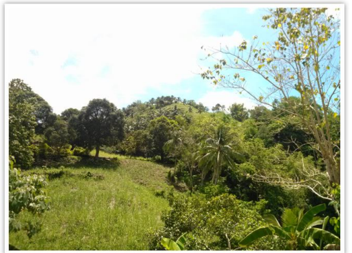
Potential Property for New Church